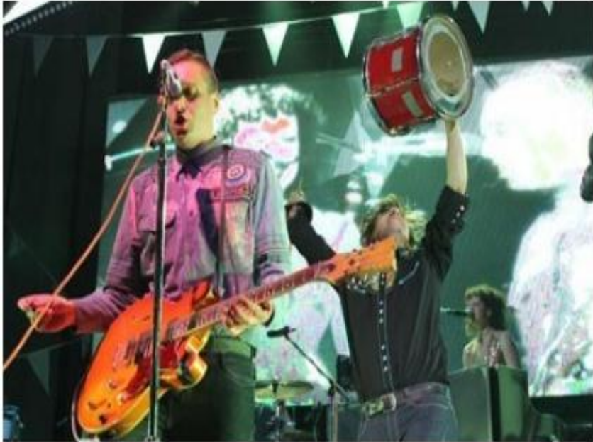
Arcade Fire